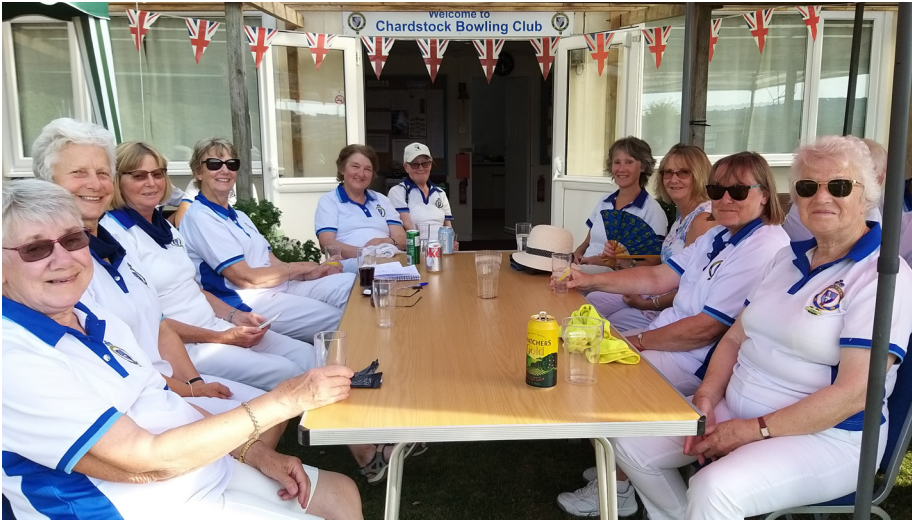
Chardstock Ladies doing what they like best - after bowling of course!